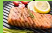
4 Grilled Salmon