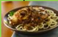
3 Chicken Marsala